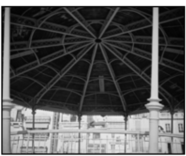
Gazebo on the Croisette