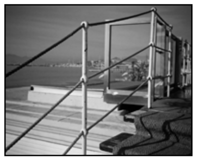
View of Cannes Harbour