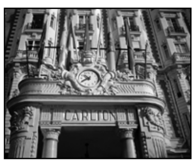
Detail, Hotel Carlton