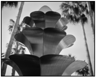
Fountain and palm trees