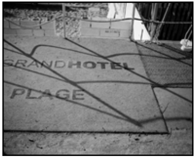
Hotel Carlton Plage