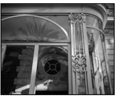
Hotel Carlton Entrance from terrace