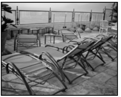
Hotel Sofitel Terrace