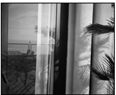
Palm leaves and window from Hotel Sofitel