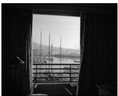
View of harbour from 2nd floor