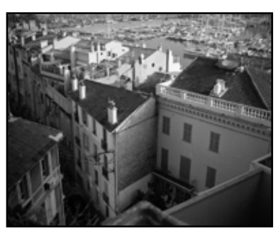
View of city from Hotel Sofitel terrace

View of street from Hotel Sofitel terrace