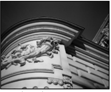
Hotel Carlton Entrance