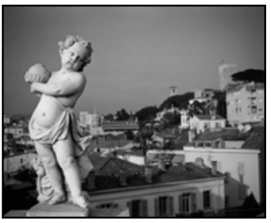
Statue and view of Old Cannes