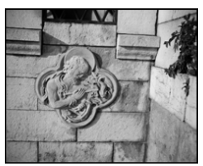
Detail of Stone Relief