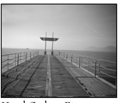
Hotel Carlton Pier